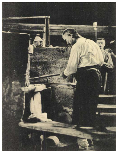
Workers in a glass factory, 1913