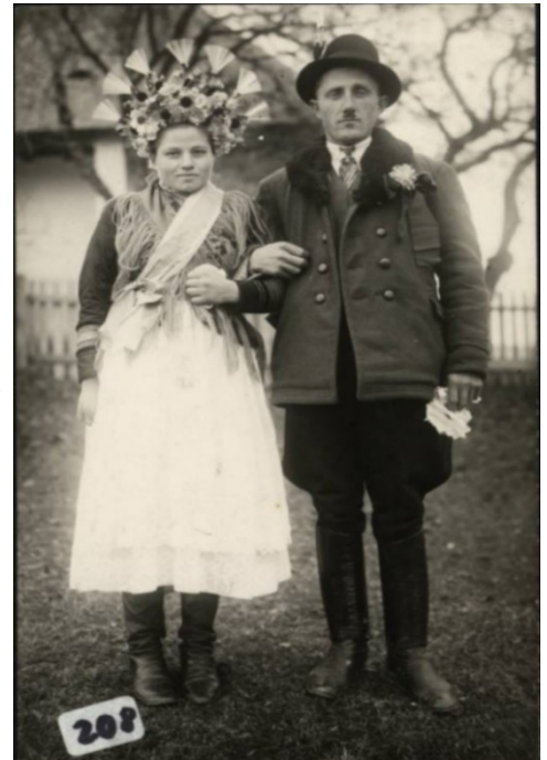
Slovakian bride and groom in the Fagetu locality – photograph taken on 26.11.1933

Slovak culture, calendar customs form a special structure that is strictly respected by all members of the community. Here are some of the most important holidays of the Slovak community: