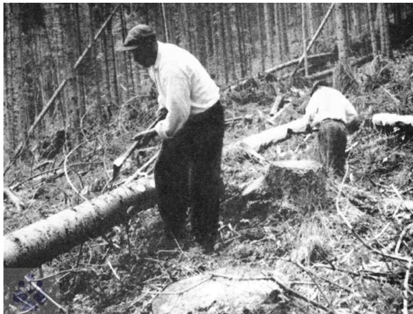
Cleaning up of a tree trunk by cutting off the branches with an ax

The long-term stay of the men away from the household influenced the way of life of their families, leading to a reorganization of the community. All who remained home were involved in the maintenance of the household, and the kids were raised by women or older family members.