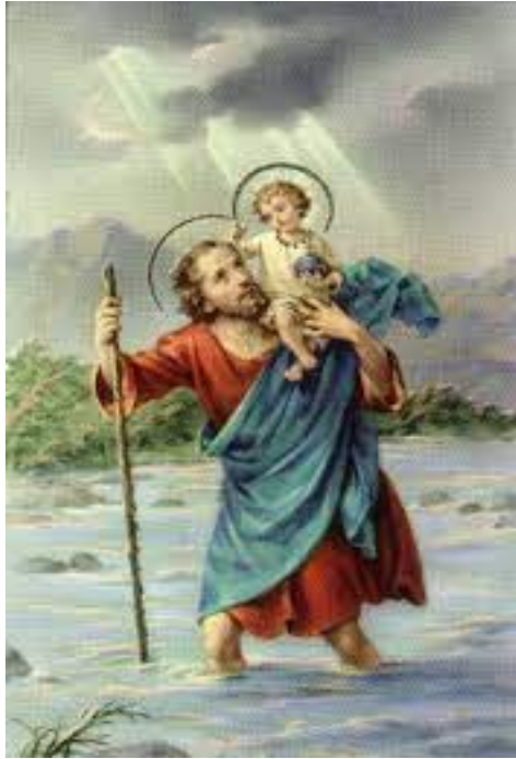
Religious representation of St. Christopher