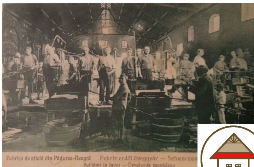
Fabrica de sticlă din Pădurea-Neagră Fekete erdői üvegyár – Schwarzwald Suliători în lucru – Üveglövők munkában The glass factory in Pădurea Neagră – blowers