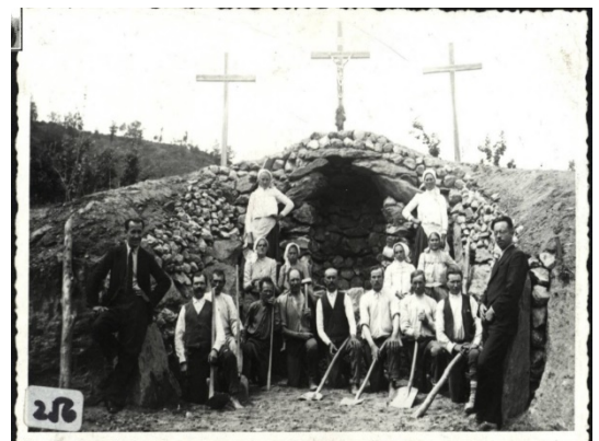
Construction of Kalvaria and the Lourdes Cave in the Sacalasăul Nou locality

In the Catholic cult, the Lourdes caves are considered witnesses to the appearances of the Holy Virgin Mary. Throughout history, there are numerous references to her apparitions, with the purpose of providing guidance, of encouraging believers, of healing or working wonders. One of these apparitions took place of February 11 th 1858 in Lourdes, a small French locality situated at the feet of the Pyrenees. The Virgin revealed herself to a 14-year-old girl, Bernadette Soubirous, who had gone out to gather brushwood together with her sister and a friend. Sick with asthma, the girl could not keep pace with the two girls; left behind, she is surprised, at a cave entrance, by the presence of a “lit up, smiling lady dressed in white, wearing an azure ribbon”. Frightened, Bernadette fell to her knees and started praying. When the other two girls returned, they found Bernadette glowing with happiness. Believers regarded