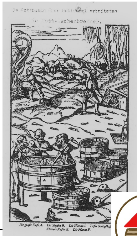
Illustration of a potash hut in Pottbusch (Germany) – Potash burning (Fig. LESSMANN 1984,